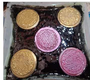
Option: Sri Yantra Orgonite decal in base of Abundance Pyramid