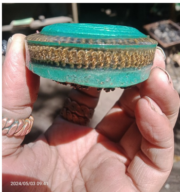
Option: Sri Yantra Pendant with Feedback Loop