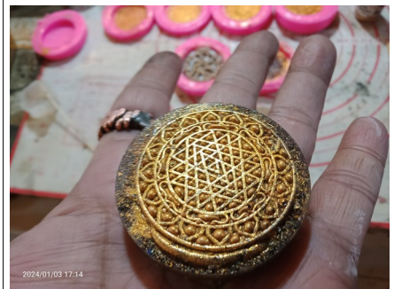
Sri Yantra Orgonite in Gold