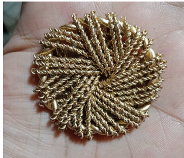
Option: Starship Rodin Tensor coil