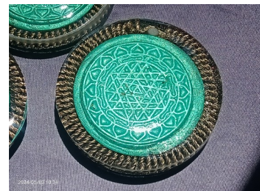
Option: Sri Yantra Pendant with Feedback Loop