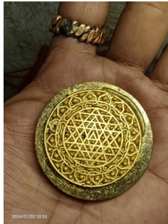
Sri Yantra Orgonite in Gold