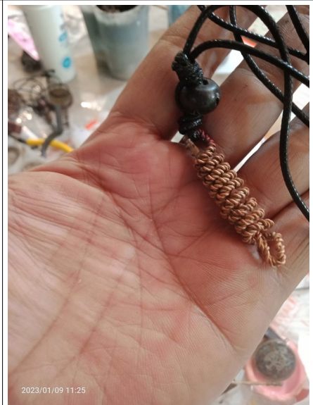
Small Infinity Coil