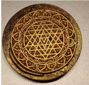
Sri Yantra Orgonite in Gold