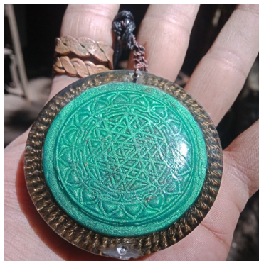
Option: Sri Yantra Pendant with Feedback Loop