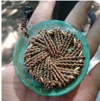
Option: Starship Rodin Tensor Coil in back of Sri Yantra Pendant